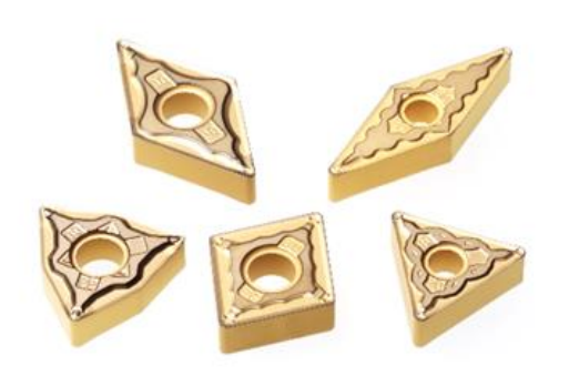
Carbide inserts with new coating material CA025P

Steel is often used in numerous industries including automotive and industrial machining. There is a growing demand for long-lasting inserts with excellent resistance against wear, fracturing and chipping capable of stable machining performance over a wide range of cutting conditions. Kyocera's new industrial cutting tool series features multilayer CVD coatings with a layer using a thick film of aluminum oxide (Al2O3) for excellent heat resistance. Utilizing cemented carbide as a base material ensures excellent fracture resistance, long-term performance, and longer tool life. These new cutting tools can accommodate a wide range of machining applications from roughing to finishing by using a variety of chipbreakers. Kyocera aims to support customers by reducing the frequency of insert replacements and improving production yield.